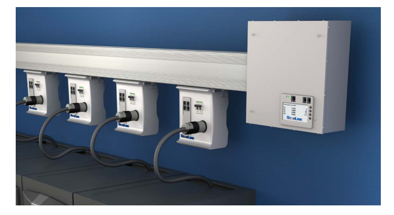
Figure 3: Busway with continuous access slot run above server racks

With data center floor space at a premium, every square foot is critical. Overhead busway systems eliminate RPPs, which result in more usable space in the data center for IT equipment and server racks. In addition, miles of power cables are eliminated when power outlets or drops can be located exactly where they are needed.