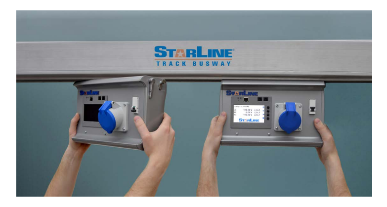
Figure 4: Example showing the ease of inserting a busway plug-in unit

When designing a data center with traditional electric systems, engineers or designers must pre-plan every outlet. Because it is nearly impossible to predetermine the power requirements for each rack in each location when a data center goes live—let alone plan for future requirements this will result in expensive and time consuming changes that will have to occur in the future. However, with a flexible, adaptable busway system, future changes that require expensive labor charges and potential outages are completely avoided.