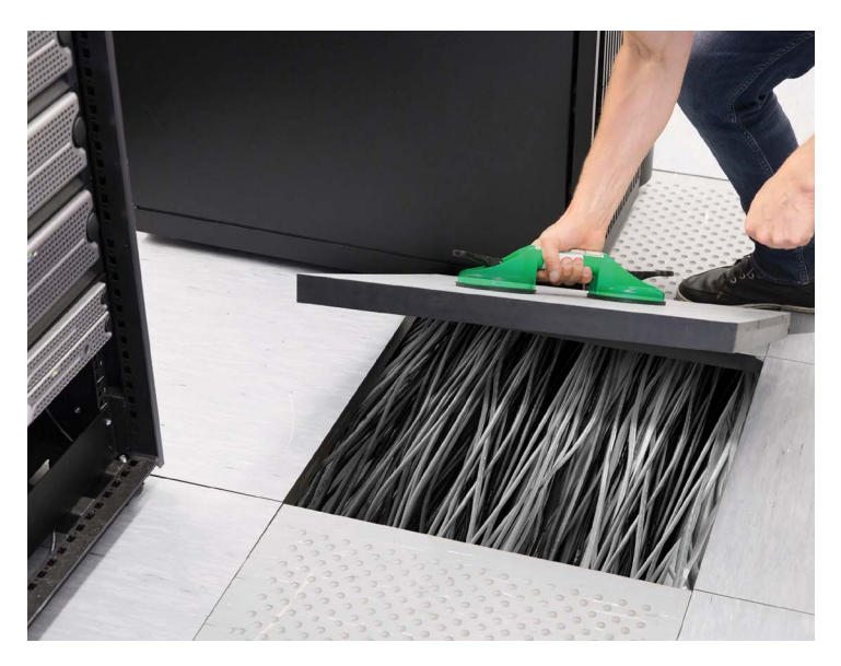
Figure 1: Traditional methods of whips and cables housed under a raised floor

Select busway systems also provide a continuous access slot to power- meaning that a data center space will always be prepared for future reconfigurations or expansion. Power can be tapped at any location with a variety of plug-in units, eliminating panel boards, long runs of conduit and wire and expensive installation costs for dedicated power outlets.